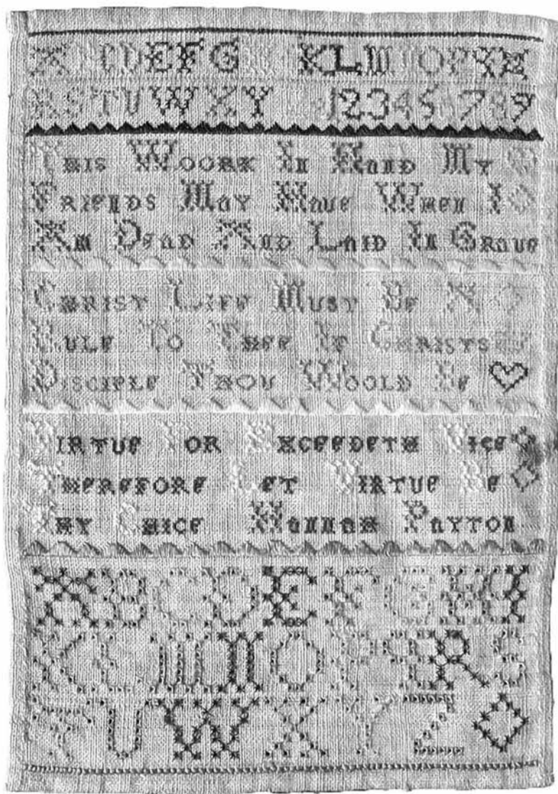
Fig. 2. Hannah Payton, sampler, undated, Quaker Tapestry Museum.

Payton's third sampler, dated 1731, is the most decorative of the set (Fig. 3). Framing a series of inscriptions stitched with a background of yellow threads is a border of sinuous, flowering stems. Underneath the inscriptions Payton stitched, which are accompanied by sets of initials of family members or perhaps classmates,