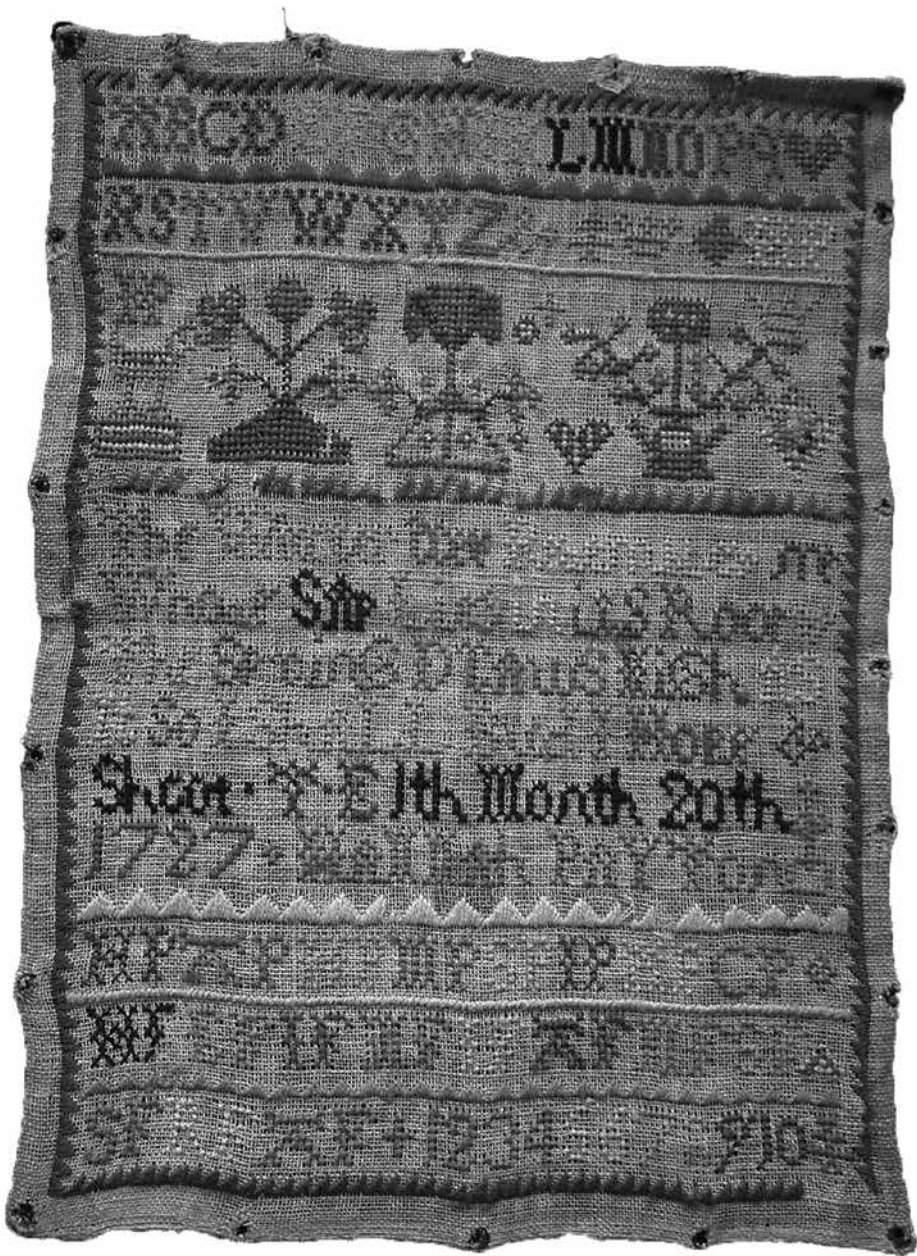
Fig. 1. Hannah Payton, sampler, 1727, Quaker Tapestry Museum.